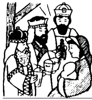
The Season of Epiphany

MINISTERS: EVERY MEMBER OF GETHSEMANE LUTHERAN CHURCH